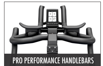
PRO PERFORMANCE HANDLEBARS