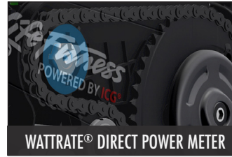
WATTRATE® DIRECT POWER METER