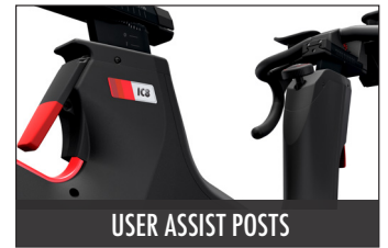
USER ASSIST POSTS