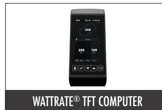
WATTRATE® TFT COMPUTER