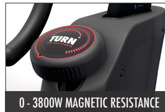
0 - 3800W MAGNETIC RESISTANCE